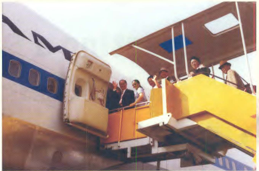
True Parents and entourage boarding the plane at Delhi, India, en route to Bangkok, Thailand, April 17, 1972

which had ended forty days earlier, unfortunately. Had they inquired into it, I might have encountered some difficulty. I took the chance because I believed that God was watching over me.