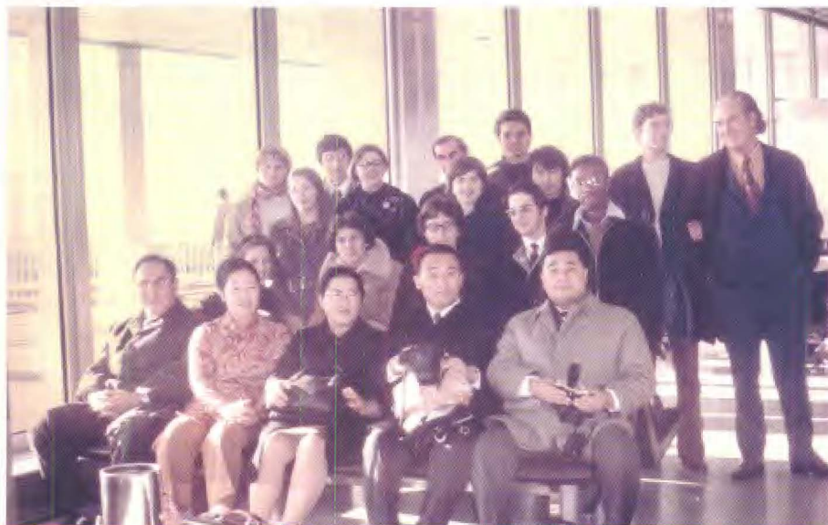
December 18, 1971: True Parents with members at the Toronto airport, about to depart for Washington, DC. This was the day True Parents moved to the U.S.

So, on December 18, I arrived in Washington, DC.