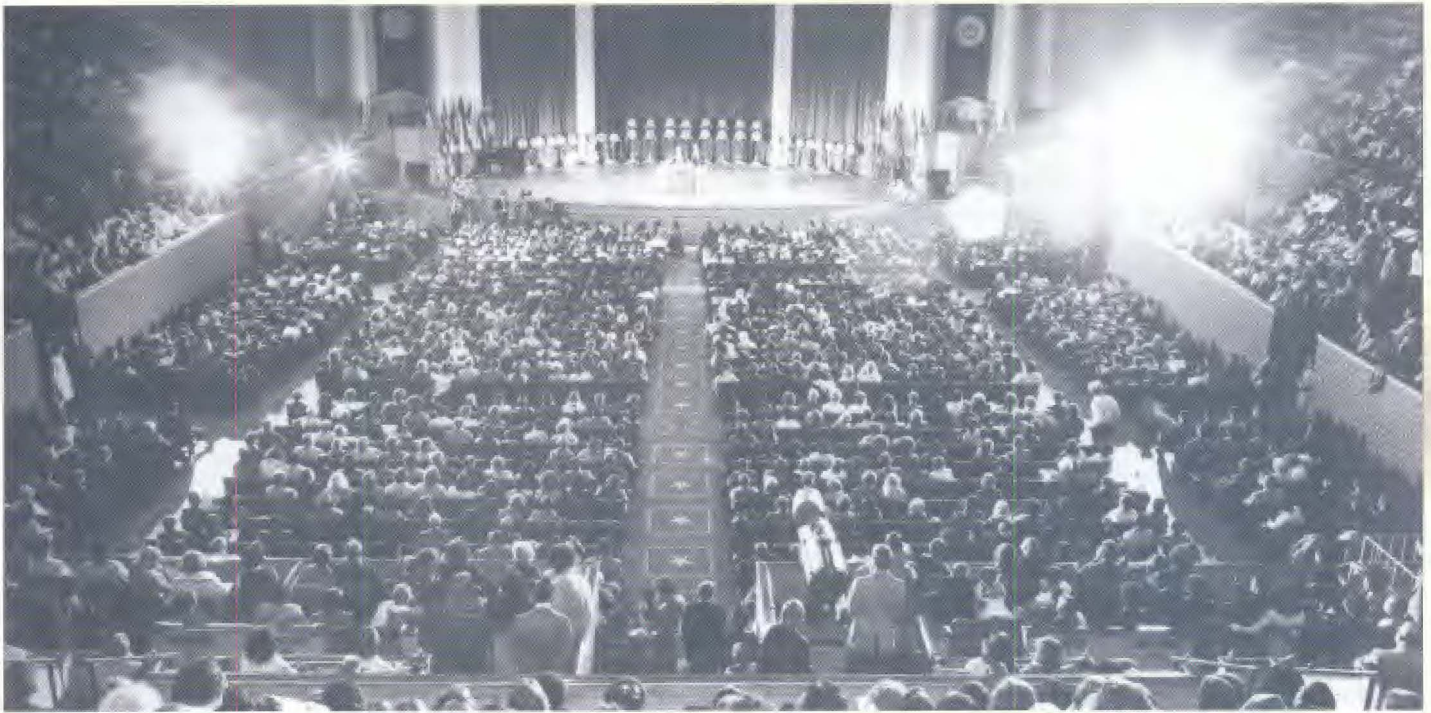
Father spoke in the Lisner Auditorium at George Washington University, Washington, DC, on February 19, 20 and 21. This was the fourth city of his seven-city Day of Hope tour.